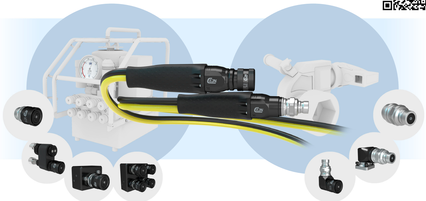
Coaxial pump connector